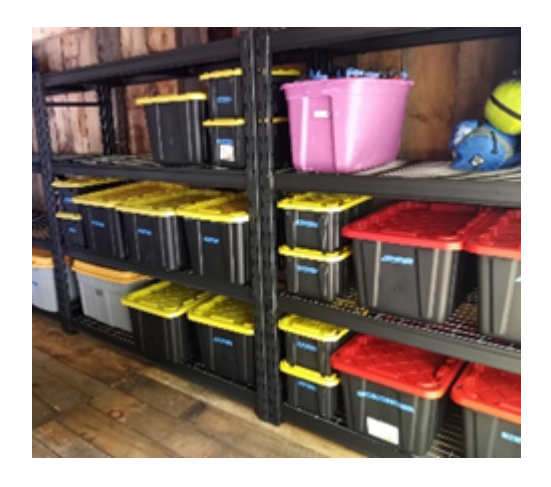
Submitted by Wendy Dziemian