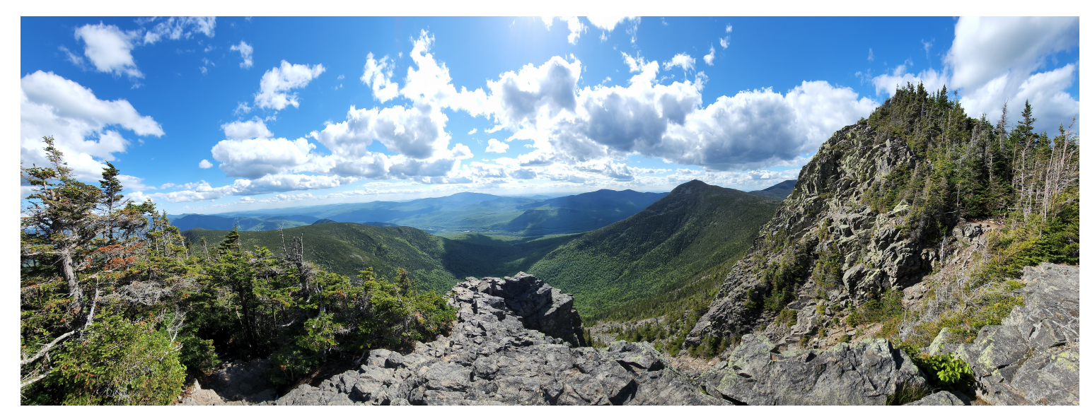
Mt Flume, June 2022